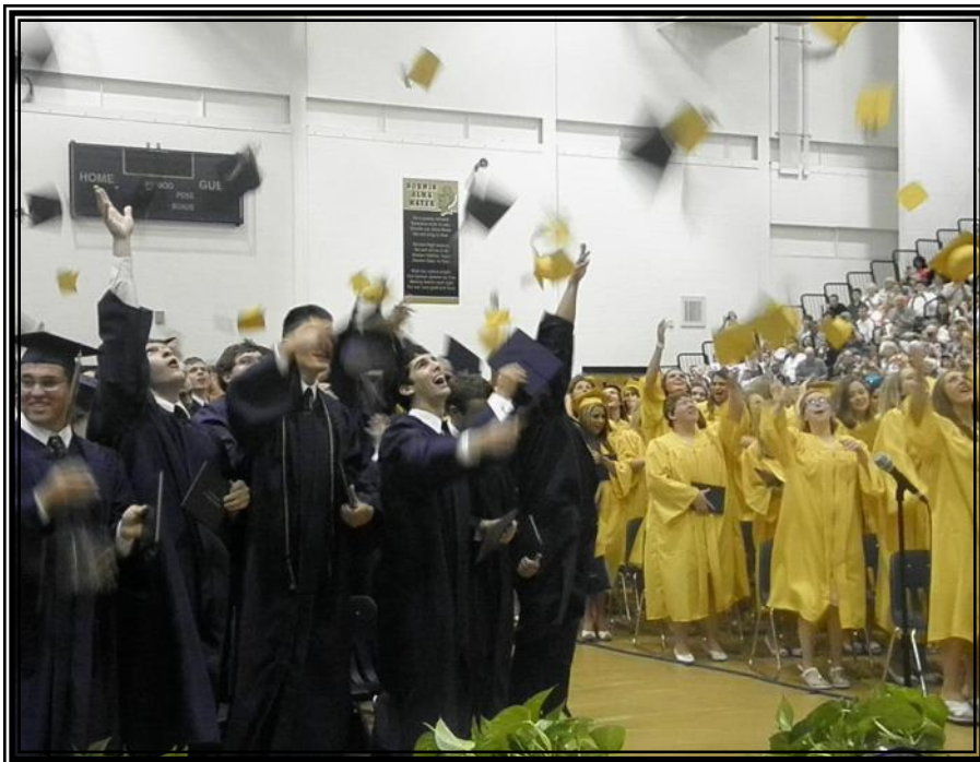
The Norwin High School Class of 2011 lets out a cheer upon graduating May 27, 2011.

Norwin School District graduated 424 students at a ceremony Friday, May 27, 2011 in the Norwin High School gymnasium.