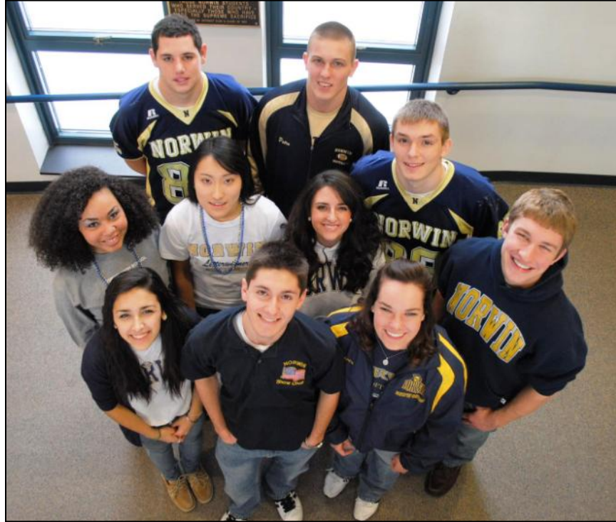
Norwin School District students had a year of great achievement in 2010-2011. Here is a photo from early 2011 of Norwin High School student leaders who represent the areas of academics, athletics, and the performing arts.

Students who have strong academics, sophisticated technical skills,